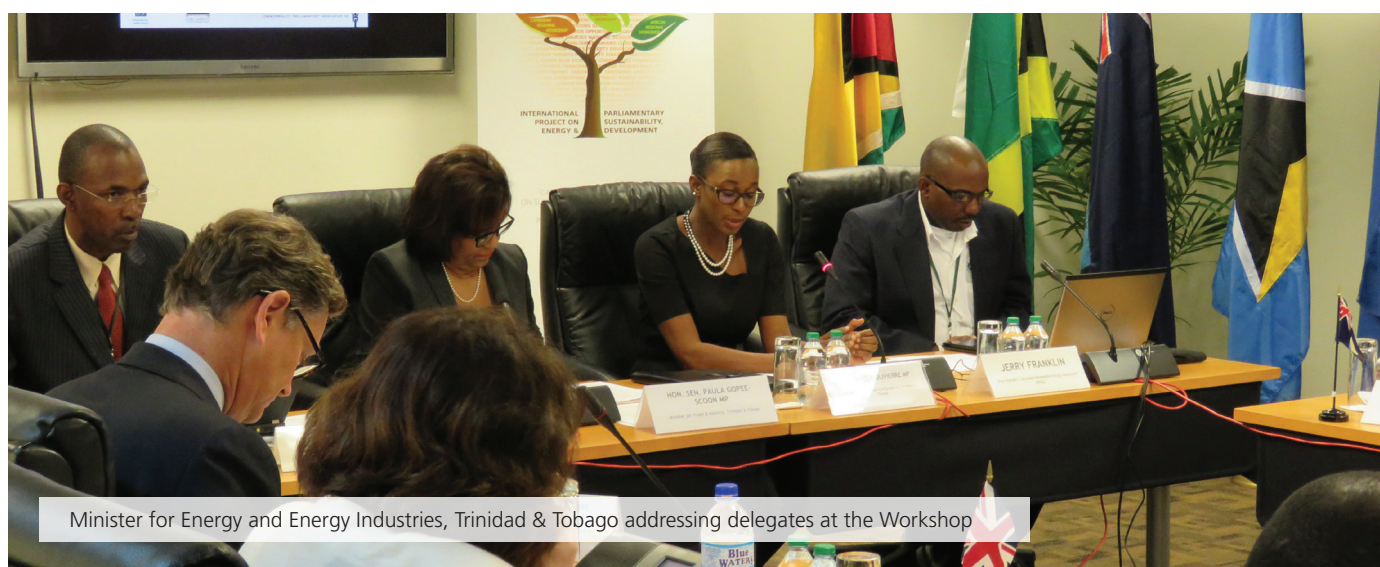
Minister for Energy and Energy Industries, Trinidad & Tobago addressing delegates at the Workshop