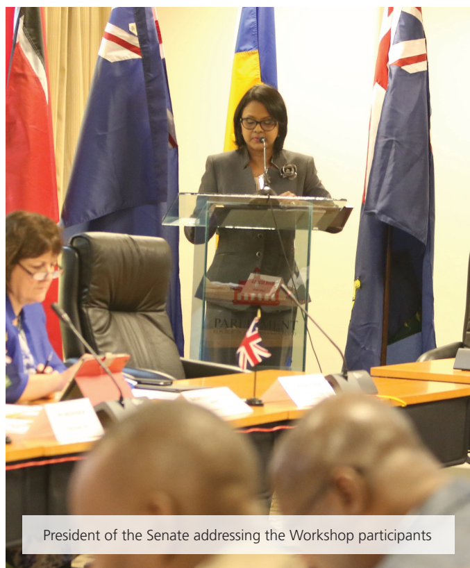
President of the Senate addressing the Workshop participants

3.08 Hon. Nicole Olivierre MP, Minister of Energy & Energy Industries, Trinidad & Tobago addressed delegates in Session 6: Renewables and Diversification . She outlined developments in energy in the country and emphasised that the onus is on parliamentarians, alongside young people, civil society and international development organisations, to