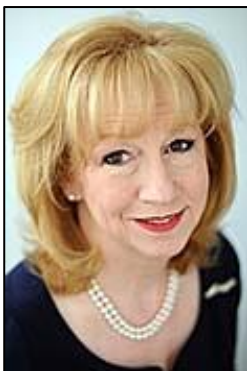
Eleanor Laing MP (Conservative)

He was first elected Chairman of Ways and Means and Deputy Speaker on 8 June 2010, and was re-elected to the post following the 2015 General Election. As Chairman of Ways and Means, Deputy Speaker, he is the senior Deputy to the Speaker of the House of Commons. He is ultimately responsible for overseeing the Budget and any other Committee of the whole House. He also serves on the House of Commons Finance and Services Committee. He was appointed as a Member of her Majesty's Most Honourable Privy Council in March 2013.