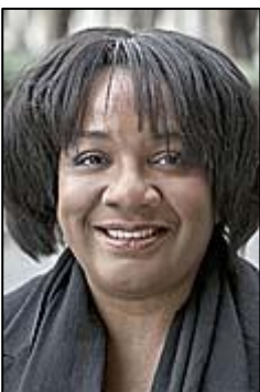
Rt Hon. Diane Abbott MP (Labour)

He is currently Co-Chairman of the All Party Parliamentary Group for International Trade and Investment and Chairman of the All Party Parliamentary Group on Shooting and Conservation, a Board Member of the Conservative Party and an Executive Member of the 1922 Committee as well as Party Chairman of the Conservative Friends of The Chinese.