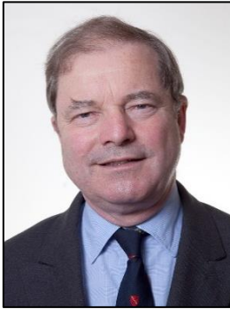
Geoffrey Clifton-Brown F.R.I.C.S. MP (Conservative)

Since becoming an MP in 1992 Geoffrey Clifton-Brown MP has served as the Parliamentary Private Secretary to the Rt. Hon Douglas Hogg QC MP, the Minister for Agriculture, Fisheries and Food; a Member of the Environment Select Committee and a Member of the Public Accounts House of Commons Select Committee. In October 2001, he was appointed a Shadow Frontbench Spokesman for Transport, Local Government & the Regions. In June 2002, he became a Shadow Minister for Local & Devolved Government Affairs. In March 2004, he was appointed as an Opposition Whip and in May 2005, he became Assistant Chief Whip. He is an active member of the Finance and Services Committee of the House since 2005.