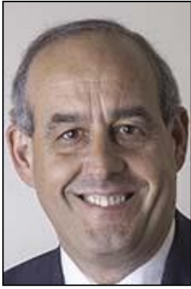
Rt Hon. David Hanson MP (Labour)

MP for Delyn since 1992, David Hanson has served as Minister of State for Northern Ireland (2005-07), Justice (2007-09) and the Home Office (2009-10). He has been Shadow Exchequer Secretary (2010-11), Shadow Minister for Policing (2011-13) and Shadow Minister for Immigration (2013-15). David previously served as the Parliamentary Private Secretary to Prime Minister Rt Hon. Tony Blair MP. He is also the Honorary Treasurer of the CPA UK Executive Committee.