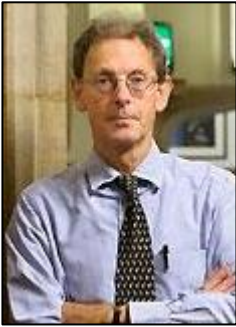
David Natzler Clerk of the House of Commons

Prime Minister 2004-05, Office of the Deputy Prime Minister (Urban Affairs Sub-Committee) 2004-05, Political and Constitutional Reform 2010-2013, Joint Committee on Human Rights 2010, Joint Committee on the Draft House of Lords Reform Bill 2011-12, Joint Committee on Parliamentary Privilege 2013 and Scottish Affairs 2013. Her political interests include education, transport, economic policy, constitution and devolution.