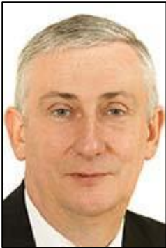
Rt Hon. Lindsay Hoyle MP (Labour)

MP for Delyn since 1992, David Hanson has served as Minister of State for Northern Ireland (2005-07), Justice (2007-09) and the Home Office (2009-10). He has been Shadow Exchequer Secretary (2010-11), Shadow Minister for Policing (2011-13) and Shadow Minister for Immigration (2013-15). David previously served as the Parliamentary Private Secretary to Prime Minister Rt Hon. Tony Blair MP. He is also the Honorary Treasurer of the CPA UK Executive Committee.