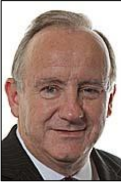
Laurence Robertson MP ( Conservative ), Chair of the Select Committee on Northern Ireland Affairs

Laurence Robertson has served as MP for Tewkesbury since 1997. He served in a number of shadow ministerial roles including Opposition Whip (2001-03) and Shadow Minister for Trade and Industry (2003), Economic Affairs (2003-05), Northern Ireland (2005-10). Since 2010, Mr Robertson has served as Chair of the Select Committee on Northern Ireland Affairs.