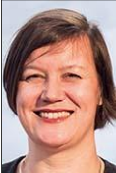
Meg Hillier MP ( Labour ), Chair of the Public Accounts Committee

MP for Delyn since 1992, David Hanson has served as Minister of State for Northern Ireland (2005-07), Justice (2007-09) and the Home Office (2009-10). He has been Shadow Exchequer Secretary (2010-11), Shadow Minister for Policing (2011-13) and Shadow Minister for Immigration (2013-15). David previously served as the Parliamentary Private Secretary to Prime Minister Rt Hon. Tony Blair MP. He is also the Honorary Treasurer of the CPA UK Executive Committee.