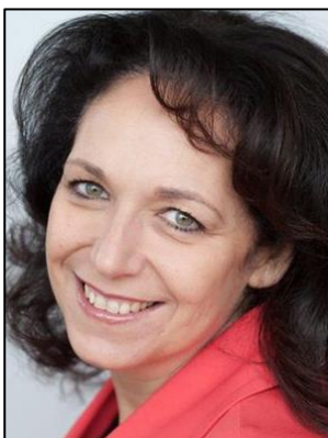
Julie Elliott MP (Labour)