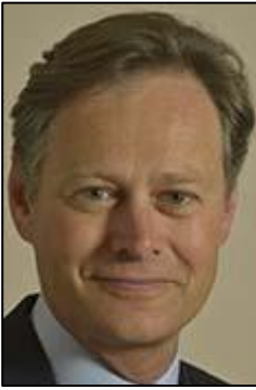
Dr Matthew Offord MP ( Conservative )

Laurence Robertson has served as MP for Tewkesbury since 1997. He served in a number of shadow ministerial roles including Opposition Whip (2001-03) and Shadow Minister for Trade and Industry (2003), Economic Affairs (2003-05), Northern Ireland (2005-10). Since 2010, Mr Robertson has served as Chair of the Select Committee on Northern Ireland Affairs.