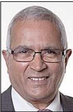
Rt Hon Lord Dholakia OBE DL ( Liberal Democrat )