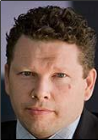
Karl McCartney MP (Conservative), Member of the Transport Select Committee

Karl McCartney was elected to parliament as MP for Lincoln in the May 2010 general election. In 2012 he was elected to the Executive of the 1922 Committee by Conservative MPs. He joined the Transport Select Committee in 2012 and was re-elected to the Committee following the 2015 general election. Following the establishment of the Committee on Exiting the European Union, Mr McCartney was elected to one of the Conservative seats on the Committee.