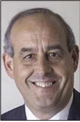
Rt Hon. David Hanson MP ( Labour ), Treasurer, CPA UK Executive Committee

MP for Delyn since 1992, David Hanson has served as Minister of State for Northern Ireland (2005-07), Justice (2007-09) and the Home Office (2009-10). He has been Shadow Exchequer Secretary (2010-11), Shadow Minister for Policing (2011-13) and Shadow Minister for Immigration (2013-15). David previously served as the Parliamentary Private Secretary to Prime Minister Rt Hon. Tony Blair MP. He is also the Honorary Treasurer of the CPA UK Executive Committee.