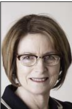
Louise Ellman MP ( Labour ), Chair of the Transport Committee

Meg Hillier is the Member of Parliament for Hackney South and Shoreditch and Chair of the Public Accounts Committee. The cross-party committee scrutinises the value for money of public spending and holds the government to account for the delivery of public services. First elected in 2005, Meg has been a junior Home Office Minister and Shadow Secretary of State for Energy and Climate Change.