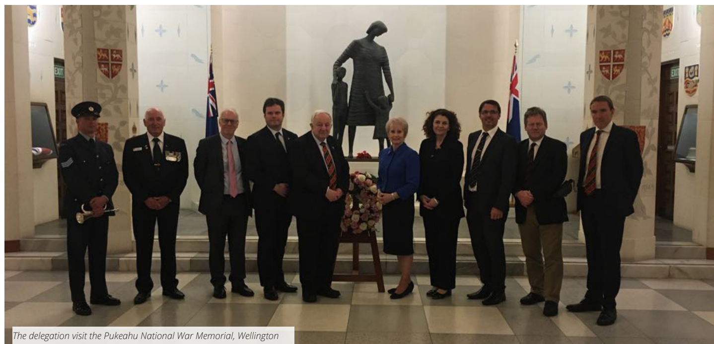
The delegation visit the Pukeahu National War Memorial, Wellington