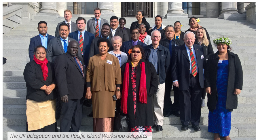
The UK delegation and the Pacific Island Workshop delegates

The bilateral element of the delegation was followed by the Pacific Islands Parliamentary Workshop which provided an opportunity to engage with parliamentarians from ten Pacific Island countries on areas of mutual interest. This has been covered in a separate report.