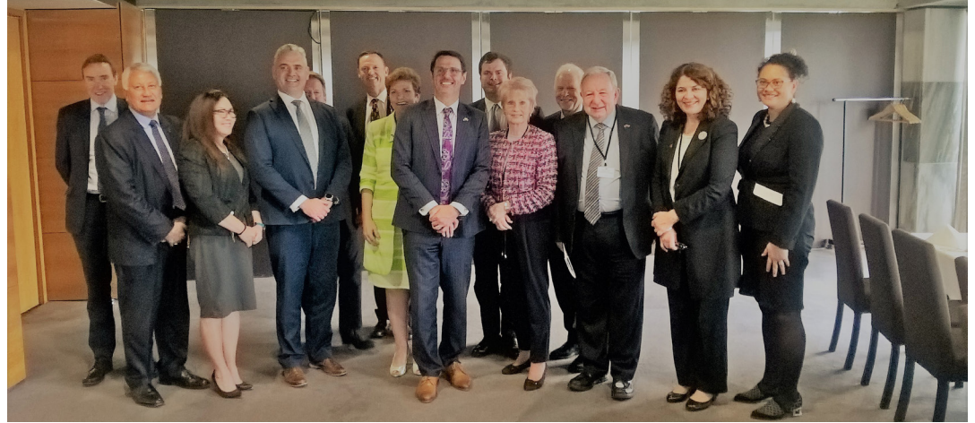
The delegation meet with members of the Commonwealth Parliamentary Association New Zealand Branch

New Zealand will continue to be a key partner, especially in the post-Brexit landscape, as the UK seeks to renew its relationships with its Commonwealth colleagues.