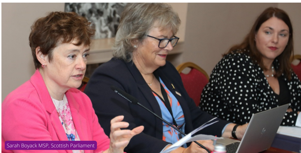
Sarah Boyack MSP, Scottish Parliament