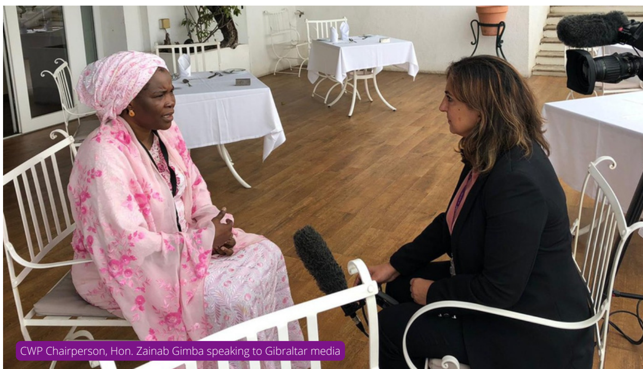
CWP Chairperson, Hon. Zainab Gimba speaking to Gibraltar media

Gibraltar's Commonwealth Youth Parliament delegate, Adriana Lopez, found it inspiring to see the number of local women interested in politics."On a personal level this afternoon has been inspiring because I can see the conversations that we are used to having are finally more tangible," she said.[1]