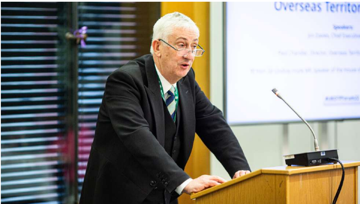
The Rt Hon. Sir Lindsay Hoyle MP speaking at the Official Opening of the Forum

“Delighted to fund the work that you do that carries out the democratic processes and holding government to account. We are looking forward to the parliamentary linkups between parliamentary clerks and officials across the OTs” and that “The more informed your citizens are, the more confidence they will have in your work.”