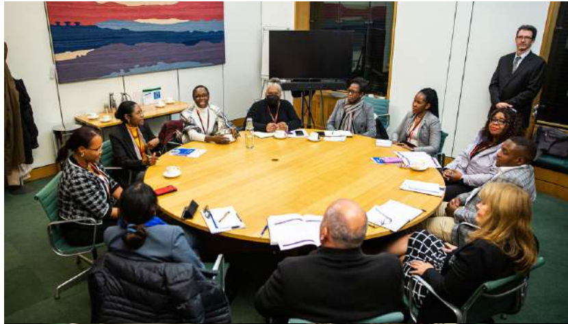
A group of external audit delegates in a meeting.

In addition to the aforementioned sessions, five meetings were held for internal and external audit delegates. These meetings covered financial audit updates, a presentation from the Chartered Institute of Public Finance and Accountancy, and risk-based auditing.