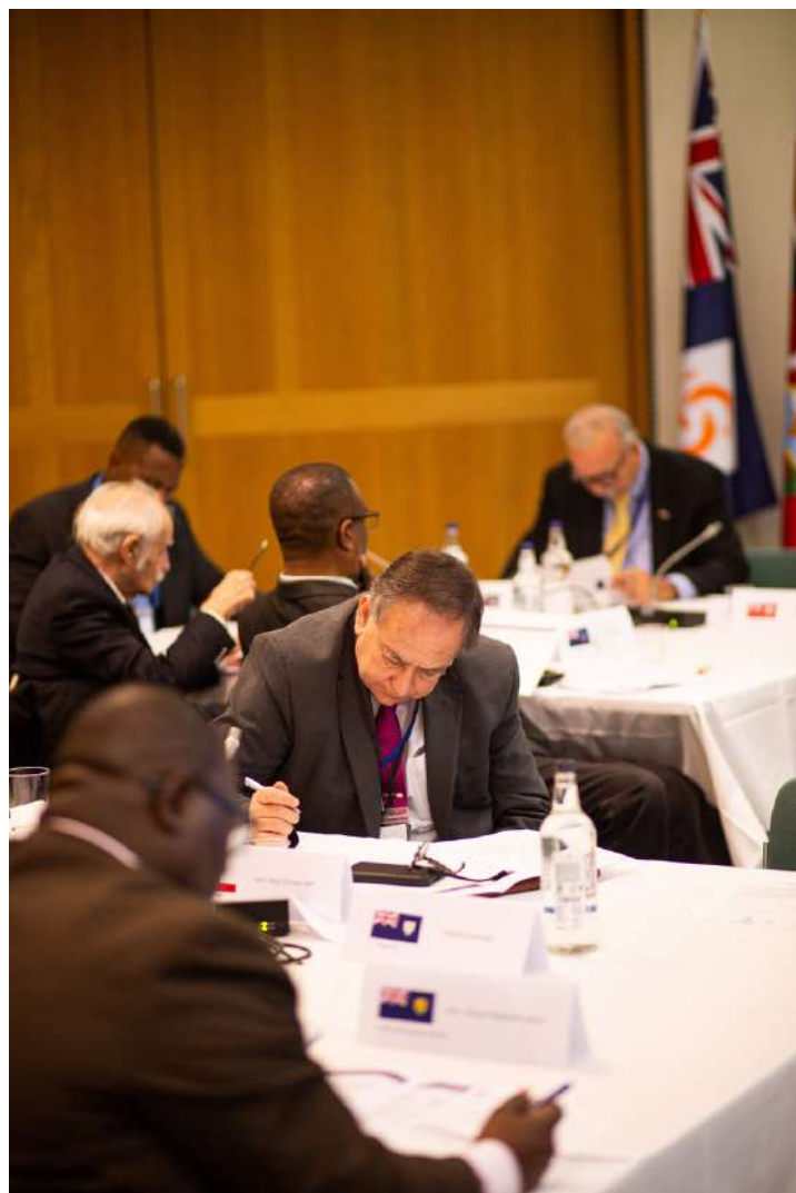
Delegates participating in the public engagement workshop activity

In addition to the aforementioned sessions, six meetings were held for internal and external audit delegates. These meetings were leadership group meetings for clerks, internal, and external audit delegates, as well as a discussion of UKOTP opportunities for parliamentarians, clerks, and audit officials in 2023-24.