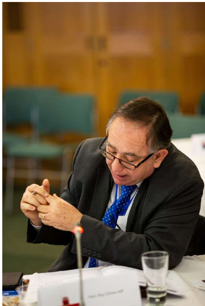
Hon. Roy Clinton MP, Gibraltar, poses a question

Another area of discussion was how standing orders related to the formation and scope of a select committee. The discussion covered the issue of defining the scope of a select committee: The description must not be too broad while detailing the scope, but should leave some margin so that a select committee is not hindered in its ability to carry out its role.