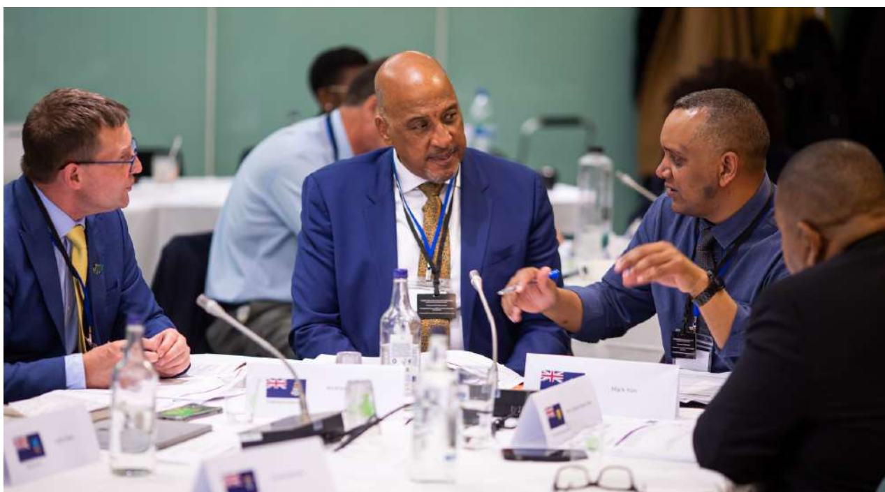
Discussing the activity: delegates from Falkland Islands, Bermuda, St Helena, and the Turks and Caicos Islands

However, there are barriers which could be rooted in citizens themselves or within the image of the parliamentarian or parliament more widely. For instance, a citizen may have low trust in politicians or have perceptions of corrupt processes. They may also perceive themselves to be marginalised where they may feel they are outside of the targeted majority or expect to be overlooked during public consultation practices. They may lack the confidence to engage due to a lack of access to information or means of engagement. Such are the signs of a non-empowered citizen, which is a failure of public engagement. On the other hand, issues around partisan divisions or opaque consultation processes may act as barriers even if citizens were more willing to engage.